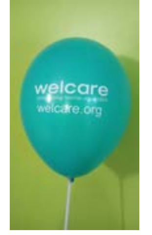
#CapeAbility Balloon Raffle

Place raffle tickets inside the balloons before you blow them up. The person with the winning raffle ticket gets a prize.